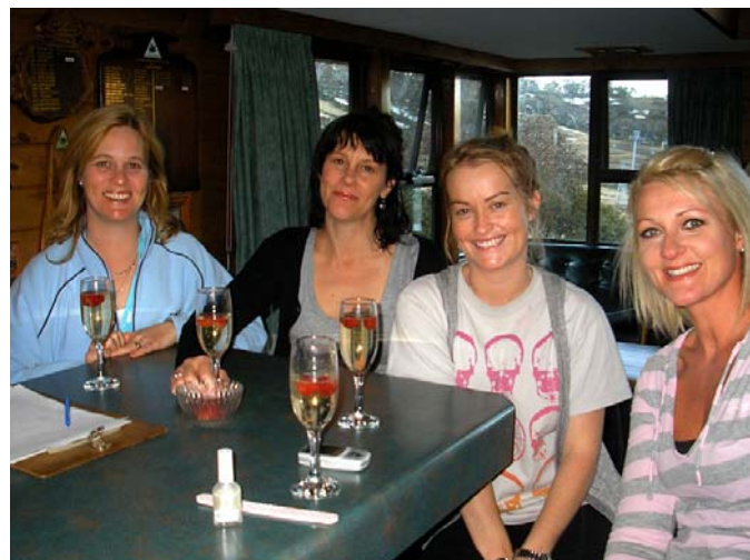
Photo: Hopefully that's Akvavit and not Champagne in those glasses!

The proposal also extends the snow and ice risk sections where chains must be carried. Of note is that the snow and ice risk section on the Alpine Way will be extended to Penderlea - before the Skitube turnoff. In other words, under this proposal, chains would have to be carried to drive to the Skitube at Bullock's Flat. The RTA website does not indicate a closing date for comments, however invites submissions.