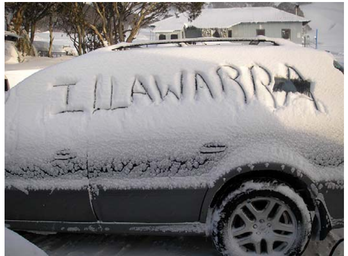
Photo: Another supporter's vehicle in the car park.