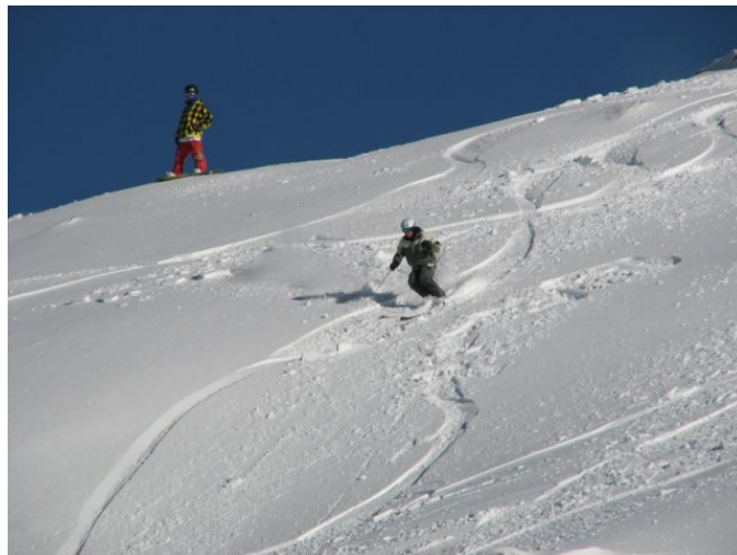
Photo: Boarders and Skiers - Harmony on the slopes.