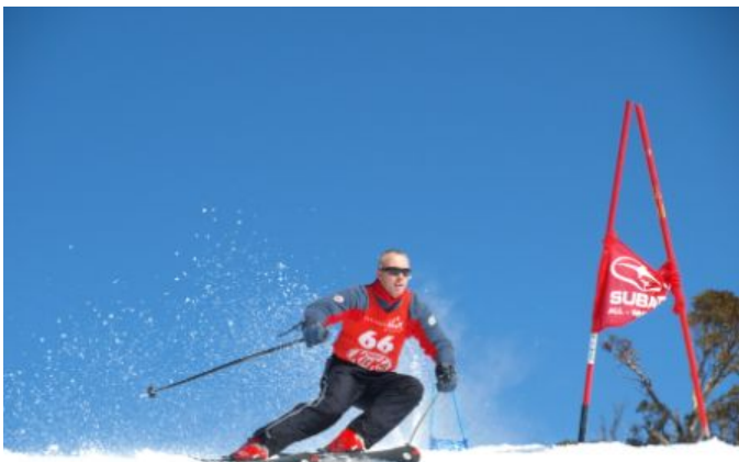
2009 Senior Interclub GS