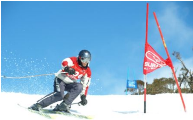
2009 Senior Interclub GS