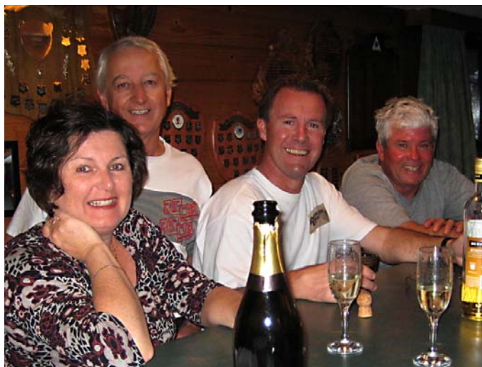
Members enjoy another chat around the bar