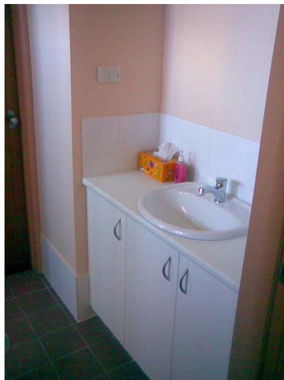
Photo: Siberia no more! Heated floors! Maybe a name change is in order...Pacific Isles maybe?

The Siberia bathrooms now have heated floors and all new amenities; this should stop people using the other bathrooms!