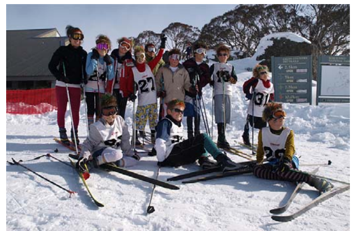
Photo: IAC cross country racers