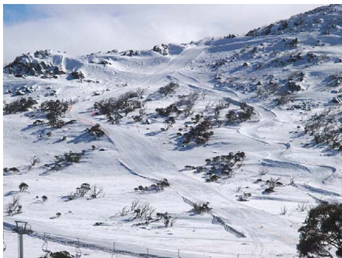
Photo: The fantastic course set up for the 2008 Club Championships.

On 9:00am Saturday we had brilliant sunshine, almost no breeze and one of the longest courses possible on the side of Blue Cow Mountain.