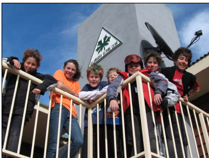
IAC Under 13 Team 2007

Racing in 2007 was a proud highlight for the Club, as our Junior and Senior teams fought hard for every hundredth of a second in the InterClub and Smiggins Bowl events – the latter thankfully able to be held and won-back from the 2005 success by a margin of one point! I think we'll claim this as a back-to-back win!