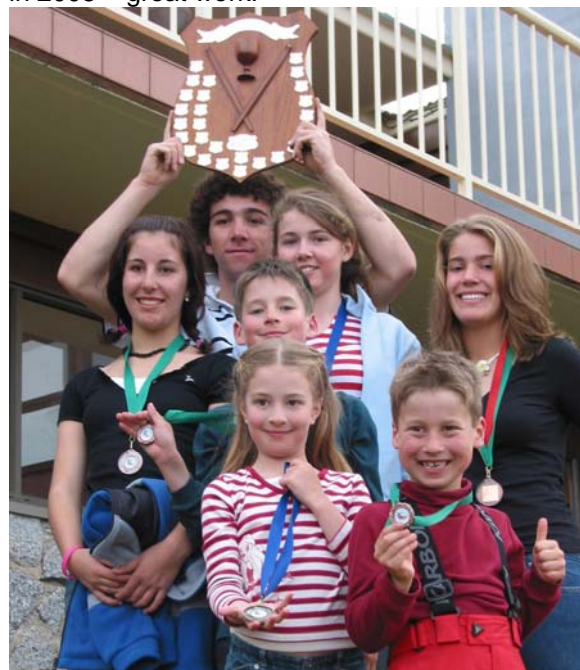
Photo: IAC 2005 Junior team triumphant with the Jnr Bowl Shield

Thank you to Caloola who were the Bowl event's hosts in 2005 – great work!