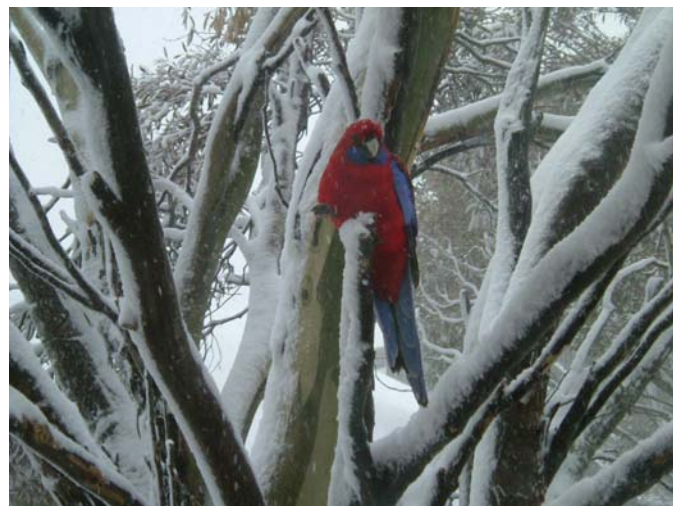
Photo: One of the 'regulars' waiting outside the kitchen window for fresh seed. We'll miss these guys too!

(Look out for the boom in homemade Hungarian lemon tarts – Ed.)