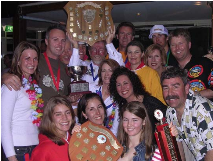
Photo: Soaking up the moment – the Bowl, Shield and Trophy all won!