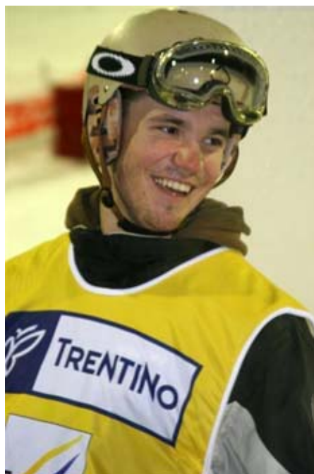
Australian skier Dale Begg-Smith – Olympic Moguls chance (shown here after 3 rd straight Worldcup Moguls win - currently ranked World No.1)