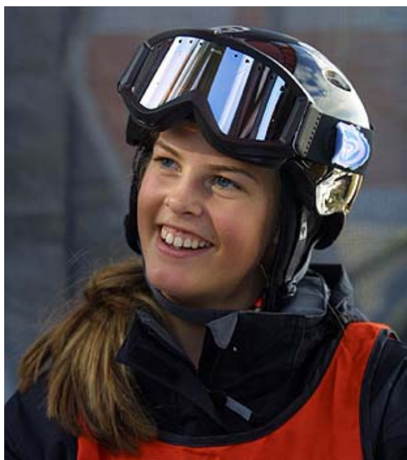
Local Cooma Snowboarding identity Torah Bright is a real podium contender for the Olympic Halfpipe

The size of the team for the February 10-26 Olympics is a big increase over the 27 athletes sent to the last Winter Games in Salt Lake City four years ago.