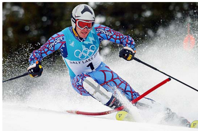
US Champion Bode Miller