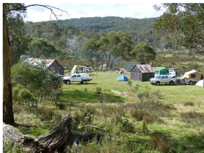
Photo: IAC work party settles in at Tin Mines