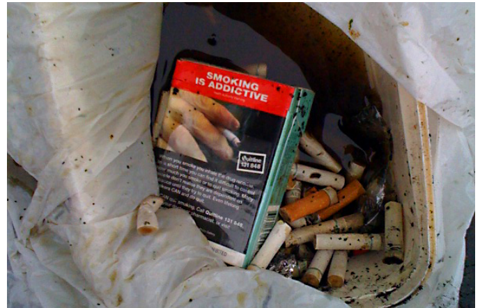
Photo: Cigarette butts and packets left outside the lodge during a summer stay. Discovered at the recent working bee.

At the recent food weekend working bee, it was disappointing to find evidence that the Club's non-smoking policy had been ignored by members and / or guests staying at the lodge through the summer. There is an obvious fire hazard when flicking butts off the balcony into the dry bushes below, not to mention the fact that our Lodge resides in a National Park which should be kept free of litter of any kind. Summer visitors are required to leave the Lodge in a clean and tidy state, and this has not been the case this summer.