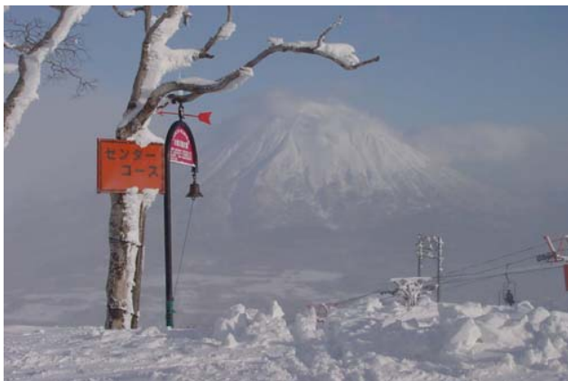
Photo: Ezo Fuji Mount Yotei-san, Hokkaido