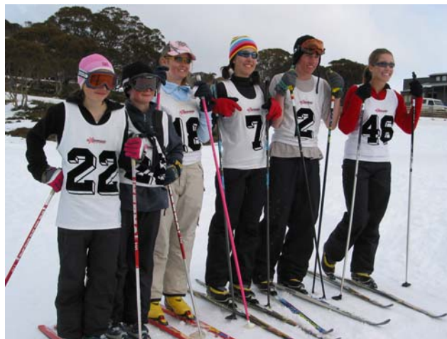
Photo: Jnr Interclub XC team 2005