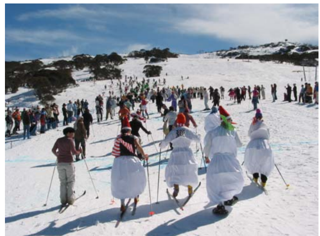
Photo: Start of 'Pub to Pub Classic' Smiggins 2005 Sun, heat, alcohol, fancy dress and XC skis... a dangerous combination!

Sample from 'Trading Post' section of IAC website: Wanted! 1 Children's Helmet - Call Margaret King on 02 42 68 00 51