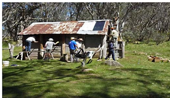
Photo: Many hands make light work.

To establish work requirements for our Easter 2010 working bee an exploratory trip was also made to Tin Mines. While there a temporary prop to the NW chimney was put in place.