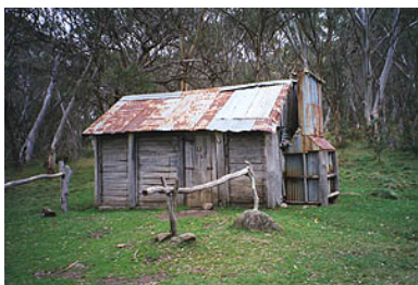
Photo: Cascades Hut, built in 1935 originally with bark roofing and regularly restored and maintained by IAC with permission from NPWS