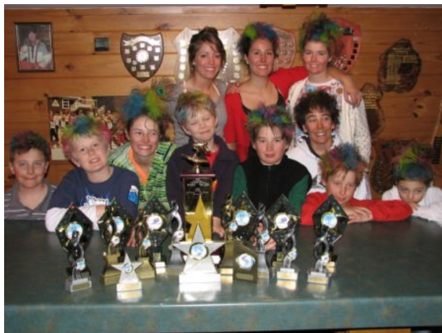
Photo: A cabinet's worth of trophies won by our Junior Illawarra Interclub race team on Sept 1, 2007

Another successful Training and Racing season just a month away from starting – I hope everyone's printed a copy of the Club Programme from our website and noted the key events and dates.